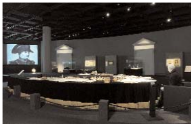
Museu de Arte Brasileira - MAB

Museu de Arte Sacra Av. Tiradentes, 676 – Luz Phone: 55 11 3326-1373